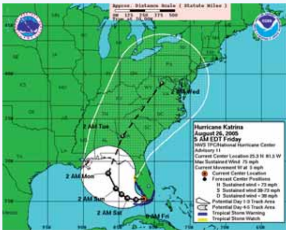
The forecast issued by the National Hurricane Center at 5AM EDT August 26, 2005. Initial forecasts had Katrina heading toward the panhandle of Florida. Subsequent forecasts as Katrina moved into the Gulf of Mexico trended toward New Orleans and Southeast Louisiana. The cone of uncertainty is outlined in white.

Mexico, NHC predicted with great accuracy where Katrina was eventually going to hit.