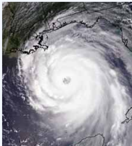
The VIIRS sensor on NPOESS will deliver spectacular images such as this taken of hurricane Katrina. This image was taken with the VIIRS precursor instrument on EOS Aqua on August 28, 2005 at 1:00PM EDT.

When a hurricane, such as Katrina, approaches the coastline NOAA issues a forecast of where the storm is expected to strike and how intense it is expected to be. The hurricane warning is based primarily on numerical weather prediction (NWP) models that use satellite, aircraft, and land/ocean-based in situ observations to represent the current or "initial"