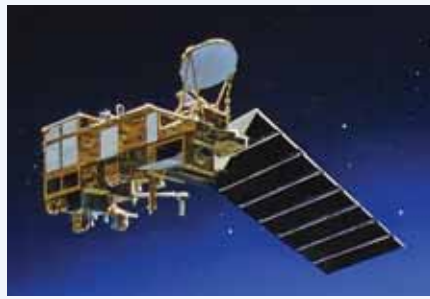
Planned configuration of NPOESS C-2. C-2 will be launched into the 1730 orbit.

The NPOESS spacecraft will carry improved imaging and sounding sensors that will increase NOAA and DoD capabilities to perform their respective weather and oceanographic forecasting missions. These sensors will monitor atmospheric,