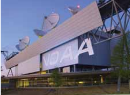
The new NOAA Satellite Operations Facility, in Suitland, MD, is designed to receive multiple data sources from NOAA satellites, MetOp and others for processing and delivery to the NOAA Environmental Modeling Center (EMC) as critical input to weather prediction models as well as for distribution to the private sector.