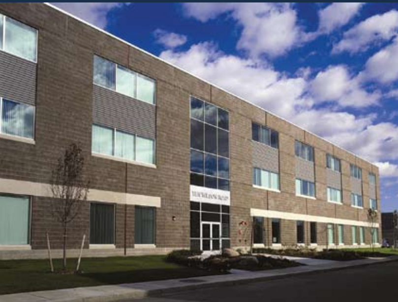
Northrop Grumman's AOA houses its manufacturing headquarters in Cambridge, Mass.